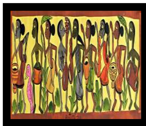
Figure-5 Tribal patachitra Bengal from joy roychoudhury's web log.

The folk traditions and morals of the rural immigrants now clashed with the increasing influence of European life style on the rich residents of the city. Its subtle influence put in place an artistic hierarchy in the minds of educated Bengali with English art at top distracting them from the work of their countrymen. During the post- independent phase, in the transformation of the patachitra, those who felt the fear of losing Indian Culture due to British colonial power would soon use folk art as a tool for elite nationalistic self-determination, setting in the motion of culture of patronage that would support the folk art into 21st century. In post-modern society the t-shirts and umbrellas are printed with the style of patuas artist paintings.