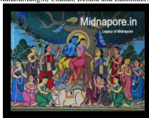
Figure 1 radha-krishna with sakhies patachitra of Midnapore.

this spectacular art form with songs to express their existence and cultural identity. Patachitra of West Bengal is generally classified in different types like Durga Pot, Tribal Patachitra, Medinipur Patachitra and Kalighat Patachitra. The themes of their painting is mostly cultural, mythological, religious, folk lore and socio-political. Most significantly, the religious patachitra of West Bengal covers the narratives of Hindu epics like Ramayana and Mahabharata and it also relates the Hindu God and goddesses Radha Krishna, Chaitanya, Kali, Lord Shiba,. Most popular of this patachitra is Bengali folklore of Manasa Mangol, Chandi, Behula and Lakhinder.