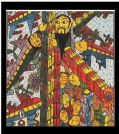
Figure-3 Swarna Chitrakar's Patachitra on 9/11.

Side by side they begin to represent the patachitra on the theme of 9/11 in USA.